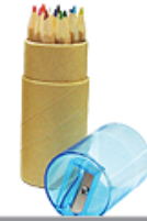
CHILDREN ITEMS / MADE TO ORDER