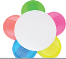
STATIONERIES / STRESS BALLS / MEASURING TAPES