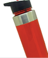
DRINKWARES / HOUSEHOLD