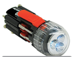
TORCHLIGHTS / CALCULATORS / RADIOS