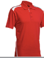
READY MADE T-SHIRTS