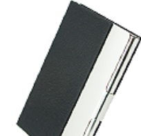
NAME CARD CASES