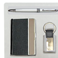
OEM SETS -MIX & MATCH SETS-