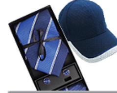
SHAWLS / CAPS/ VESTS / TIES