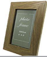
PHOTO FRAMES / COASTERS