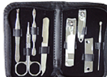
MANICURES / TOOLSETS