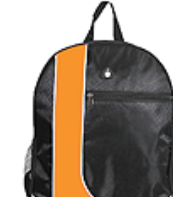
BAGS / CAR BOOT ORGANIZER