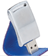
USB THUMBDRIVES / IT ITEMS