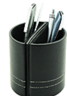
DESKTOP ITEMS / CLOCKS / PU