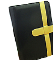
PU ORGANISERS / FOLDERS