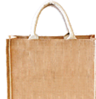
CANVAS / JUTE BAGS