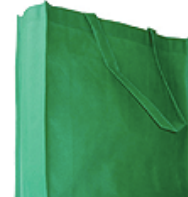
NON WOVEN / NYLON BAGS